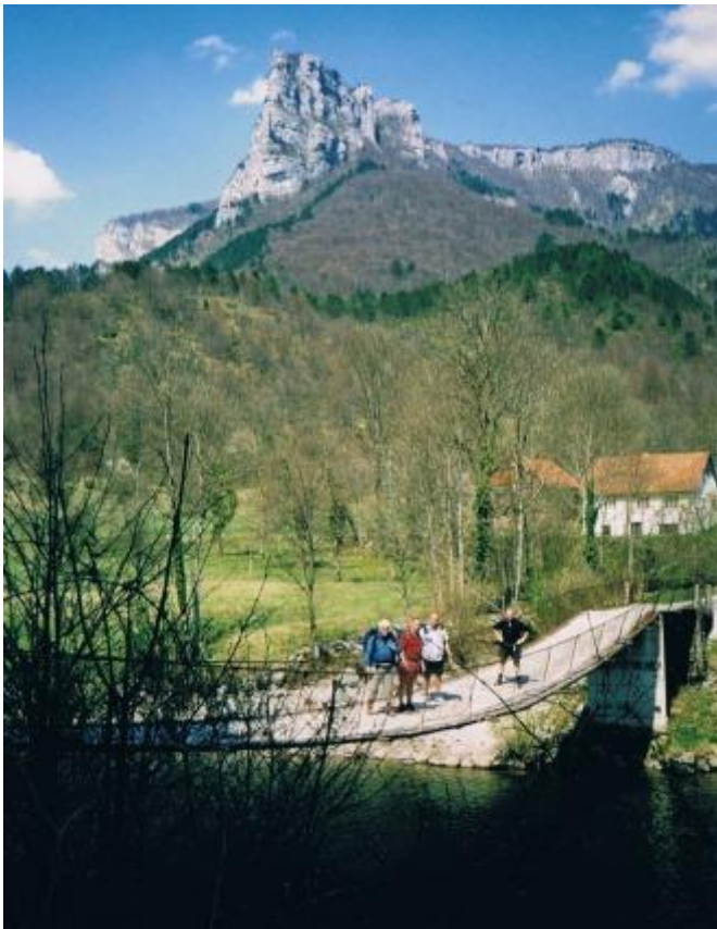
border near Osilnica, NP background